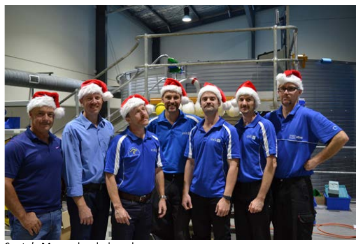
Santa's Movember helpers!

This year, UVS has made a donation to Movember, supporting the UVS team "Triton's Tache" <a href="http://au.movember.com/team/1201613">http://au.movember.com/team/1201613</a> to raise over $2000 to "change the face of men's health".